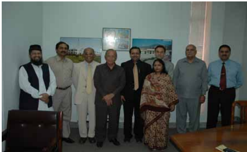
ORBIS evaluation team at the end of the project

It must be mentioned here that the support provided by ORBIS Intl USA has been remarkable and has simply transformed our pediatric ophthalmology into a regional center of excellence.