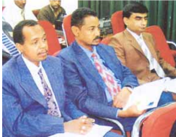
Doctors from Sudan