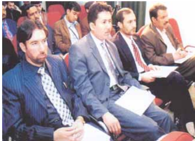
Doctors from Afghanistan