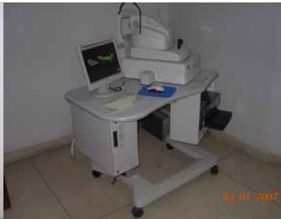
OCT-the latest technology for diagnosis of retinal diseases