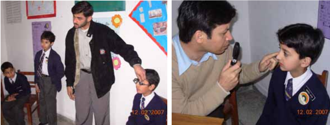
Different views of children screening

Under YFA volunteer social service program, over 40 students from different schools of the city worked at Al-Shifa during summer vacations.