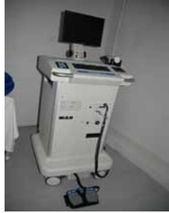
RetCam-the latest technology in child eye care comes to Pakistan for the first time