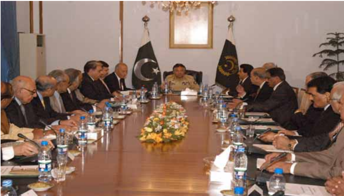
President of Pakistan chairing the annual Patron-in-Chief Meeting of Al-Shifa Trust