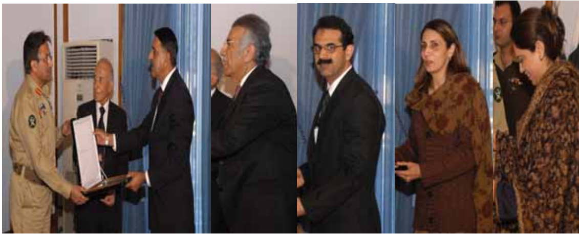
President of Pakistan distributing awards to Trustees, Donors and Doctors of Al-Shifa